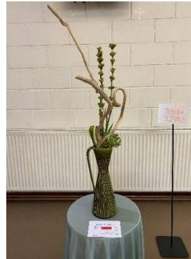
Keep it Simple – Open FIRST: Monica Read