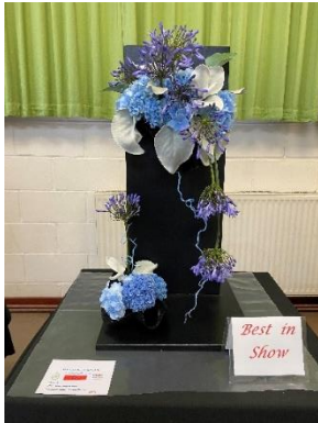
Rhapsody in Blue – Master Class FIRST: Carole Fitchett & BEST IN SHOW)